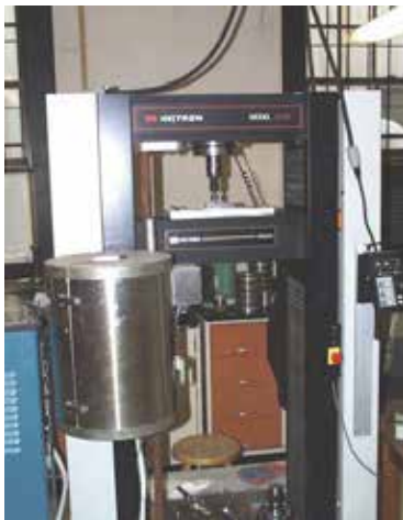
Figure 1. Intron Compression Test Machine

The test procedure is simple. Half inch diameter monel "buttons" were loaded in compression against a stainless steel block. The button was then rotated through 360 degrees, the material couple was unloaded, separated and checked for evidence of galling. This procedure was repeated for various loads until a transition between galling and no galling was determined. Figures 1-3 show the overall test set-up and an example of a galled material couple.