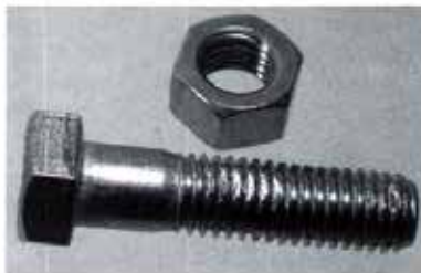
Stainless steel bolt with intentionally damaged threads.