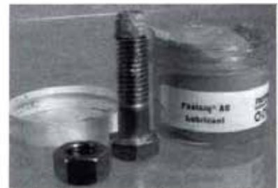
Anti-galling compound placed on bolt's end threads.

The threads of a 1/2-13 302 stainless steel bolt were severely damaged by striking them repeatedly with a hammer. It was reasonable to assume that a 302