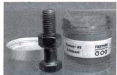
Nut goes entire length of bolt thread without seizing.