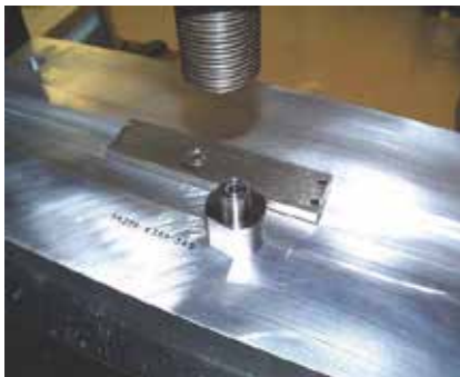
Figure 3. Galled Test Button and Block