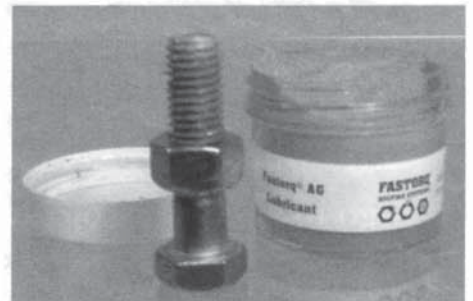
Nut goes entire length of bolt thread without seizing.