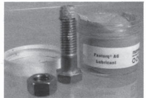
Anti-galling compound placed on bolt's end threads.

The threads of a 1/2-13 302 stainless steel bolt were severely damaged by striking them repeatedly with a hammer. It was reasonable to assume that a 302