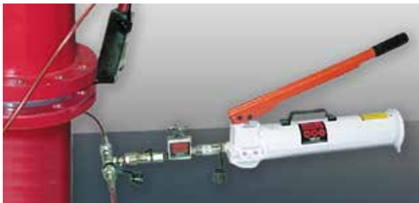
Model 100H2 Hand Pump