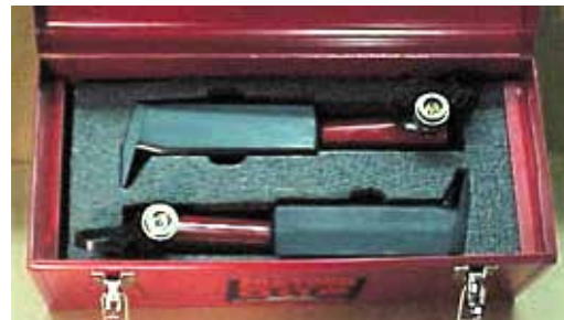
AutoSPREADERS and Safety Blocks are packed in a durable metal toolbox with custom insert