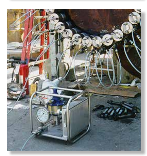
Fastorq Model HTP-2000 is powering 28 ZipTENSIONER Stud Tensioners, size 2 1/2".