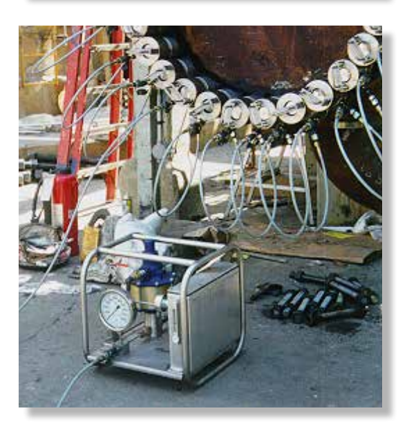
Fastorq Model HTP-2000 is powering 28 ZipTENSIONER Stud Tensioners, size 2 1/2".