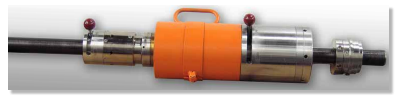
Largest Load Capacity Pulling System on the Market