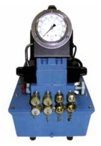
Electric Model 215E